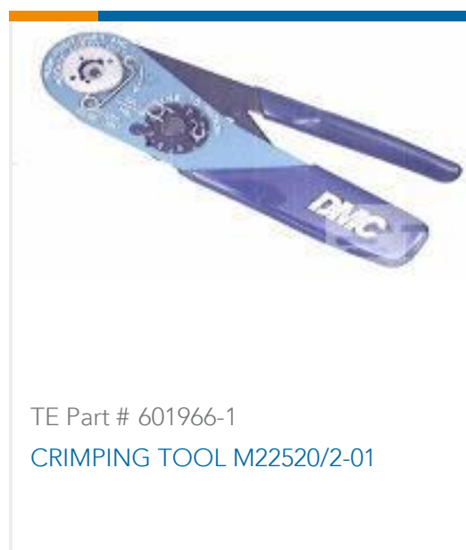
TE Part # 601966-1 CRIMPING TOOL M22520/2-01